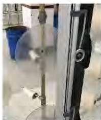
单锭吹气 Individual blowing