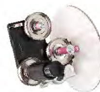
三柱磁悬浮张力器 3-pillar magnetic suspension tensioner

适用范围：适用于短纤纱 工作原理：通过改变纱线的包角，改变纱线的张力 张力范围：10-25CN For staple yarn Adjust yarn tension by changing yarn angle Tension range: 10-25CN