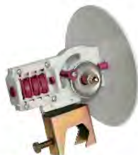
吊环式张力器 Ring type tensioner

适用范围：适用于化纤长丝和短纤纱 工作原理：通过改变纱线的包角或瓷环的个数，改变纱线的张力 张力范围：3-20CN For filament and staple yarn Adjust yarn tension by changing yarn angle or ceramic ring number Tension range: 3-20CN