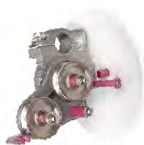
二三柱式张力器 2-pillar tensioner

适用范围：适用于化纤长丝和短纤纱 工作原理：通过改变纱线的包角或瓷环的个数，改变纱线的张力 张力范围：3-20CN For filament and staple yarn Adjust yarn tension by changing yarn angle or ceramic ring number Tension range: 3-20CN