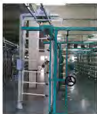
巡回吹吸风装置 Travelling cleaner