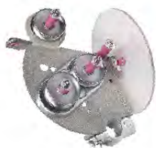
三柱式张力器 3-pillar tensioner

适用范围：适用于短纤纱 工作原理：通过调节磁柱的高低，改变纱线的张力 张力范围：10-70CN For staple yarn Adjust yarn tension by lifting up and down of the column. Tension range: 10-70CN